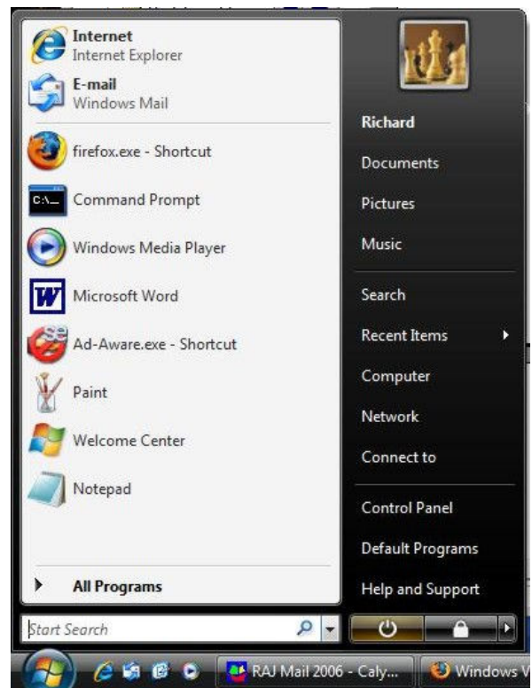
Figure 3 - Vista Start Menu

Many other features have been added as well which I won’t get into detail. Other features include: Windows Easy File Transfer, updated Windows Movie Maker, Windows DVD Maker, updated Windows Media Player, Windows Mobility Center for synching files between desktop and laptop, plus