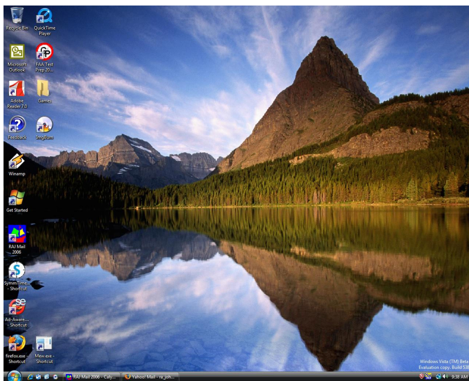
Figure 1 - Vista Desktop

The user interface has been completely rewritten to take advantage of hardware accelerated 3D graphics – this will mean that applications that are graphics intensive will run faster. Application windows on the screen can have a more translucent glass-like look, something Microsoft is calling Aero Glass. When you run the mouse over items on a screen, a preview mode is opened allowing you to see inside the files without opening them. There are 15 different desktop backgrounds , one of them is shown here in Figure 1 .